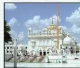
Hazur Sahib Gurudwara