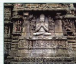
Aundha Nagnath Temple