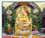
Shirdi Sai Baba