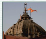
Parli Vajjanath Temple